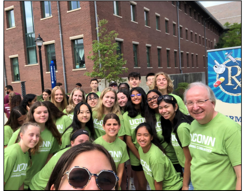
Fall 2022 Pharmacy House LC Kickoff