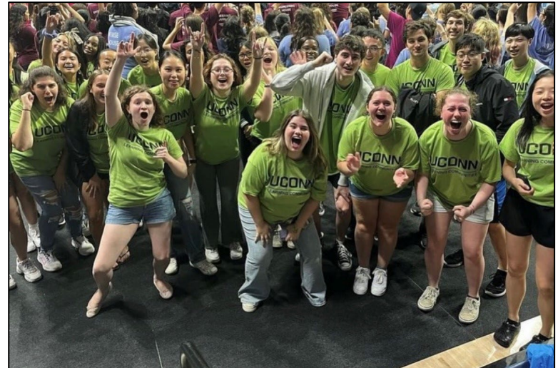
Fall 2023 Pharmacy House LC Kickoff